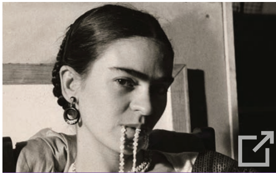
ARTS & CULTURE